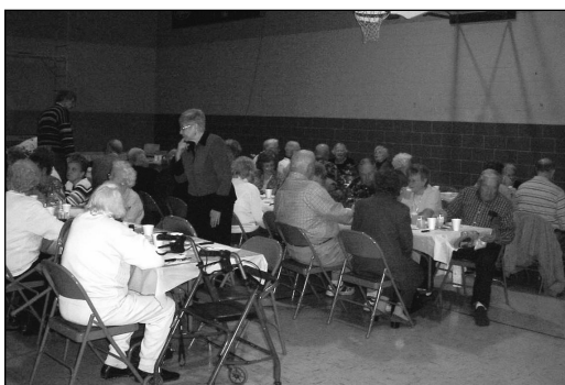
Many senior residents enjoying free Spaghetti dinner at Good Shepard Church hall provided by the Pendleton Lions.